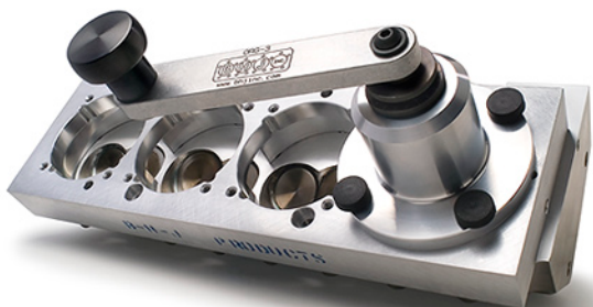
BHJ's O-Ring Groove Cutter installed on a V8 cylinder head

The 120-FNR joins the flat-nose .120" insert, as well as the .039", .048", .060" and .085" in the BHJ lineup of regularly-stocked inserts. All inserts have three cutting tips for extended use and maximum profit per part.