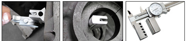
Wide Deck Anvil

The radius anvil at the far end centers quickly on any main saddle and the wide-face, flat deck anvil is easy to square-up on the deck surface.